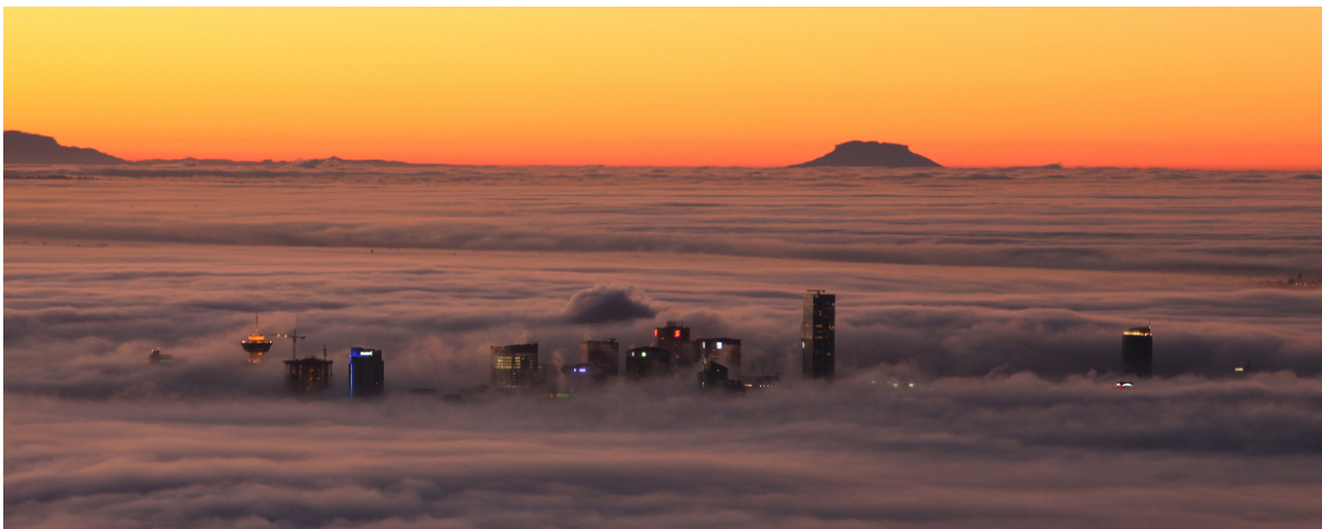
Figure 1: In the Clouds: Vancouver from Cypress Mountain. Note that the teaser may not be wider than the abstract block.

Martha Stewart‡ Martha Stewart Enterprises Microsoft Research